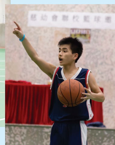
"Let's do it again!"