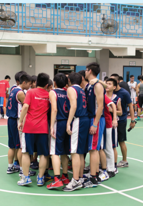
We are a team !