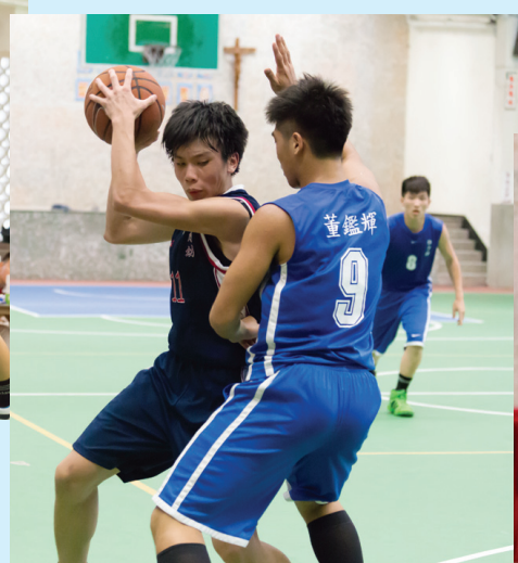
"Come on! Let's dance."