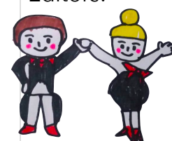
Illustration: Harry Chan 1D