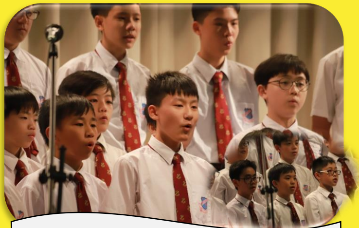
S.1 Choral Speaking Competition