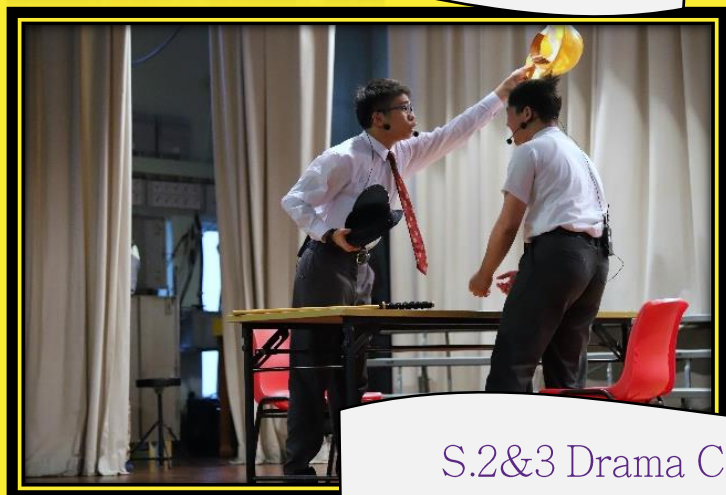
S.2&3 Drama Competition