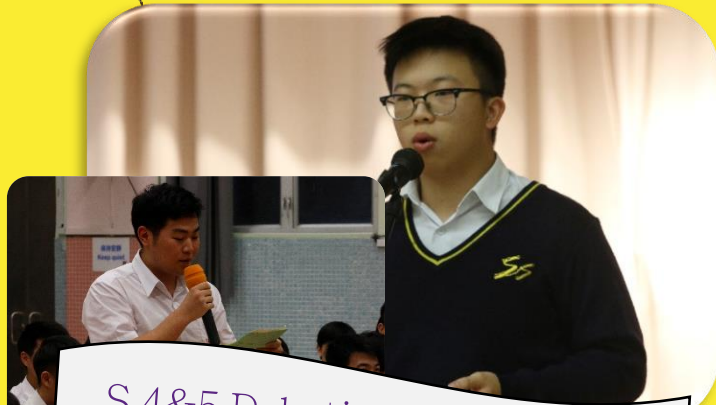
S.4&5 Debating Competition