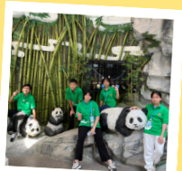
#Sichuan Panda Tour