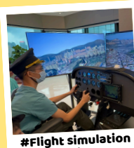
#Flight simulation experience