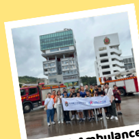
#Fire & Ambulance Education Center