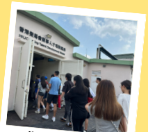
#Jockey Club Training Stable